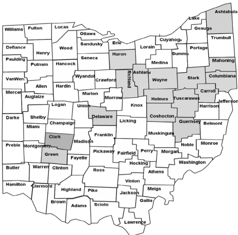
Figure 2: Locations of the 39 Ohio dairy farm businesses participating in 2015

In 2015, participating dairy farms were located in 15 counties. The majority of farms were located in the northeast part of the state.