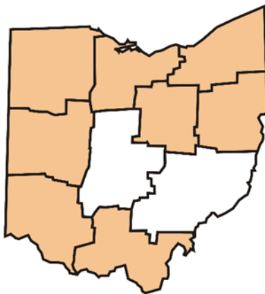
Divisional Maximum Temperature Ranks